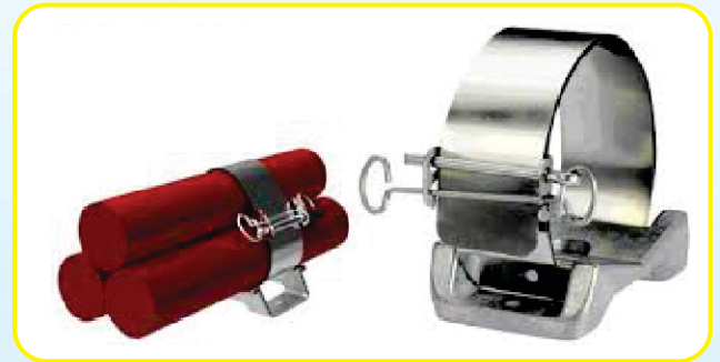
SS STRAP CLEAT FOR TREFOIL FORMATION