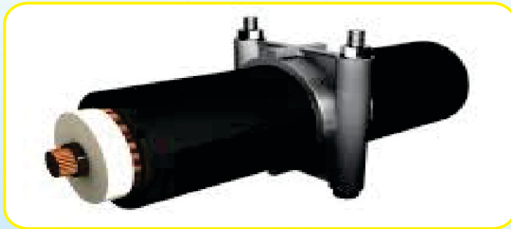
CLEAT FOR SINGLE CABLE

The SS Engineering Products range of 11kV to 400kV cable cleats is designed, constructed, tested and Third party certified in accordance with IEC 61914:2015 to ensure the safety of personnel, the protection of the cable short circuit conditions and environment in which it is situated.